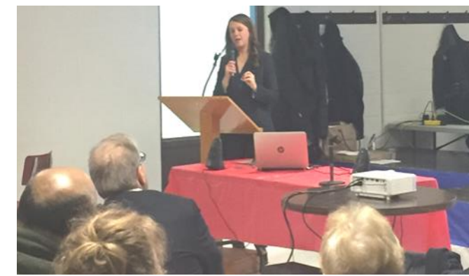
Pre-Budget Consultation Town hall at JJ Piccininni, Jan. 14