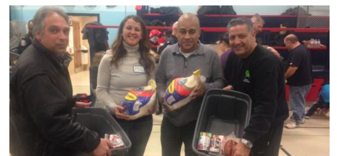
Assembling baskets for those in need at the Dovercourt Boys and Girls Club