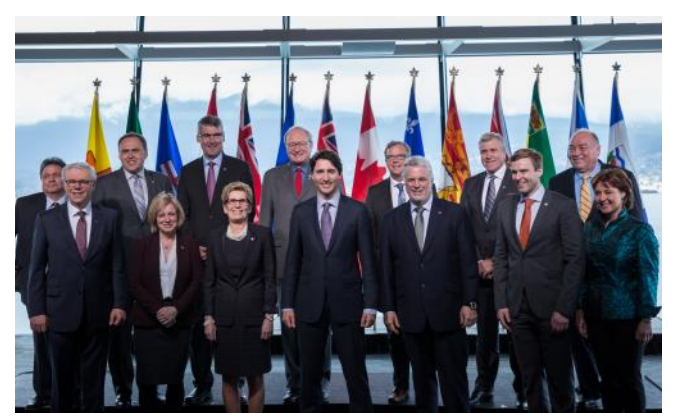
Historic agreement at the Vancouver Convention, March 2016