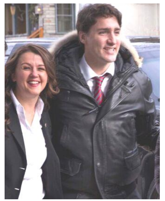
Welcoming PM Trudeau at the Dovercourt Boys & Girls Club

(Statement in House of Commons Celebrating Portuguese Casas, March.2016)