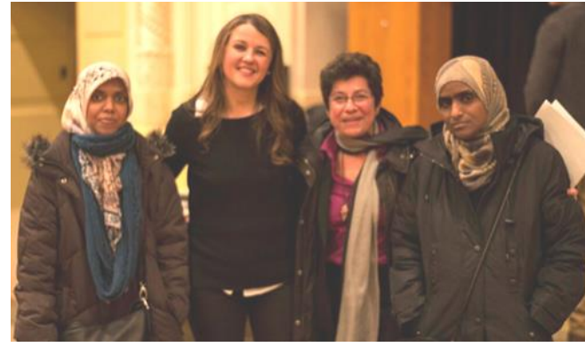
Syrian Refugee Town hall at Bloor Collegiate, Jan. 18