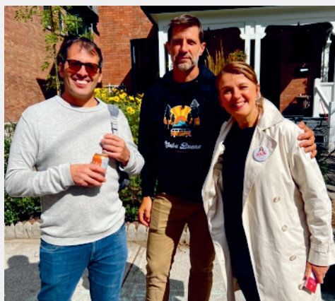
Participating in Havelock Street Car-Free Day!