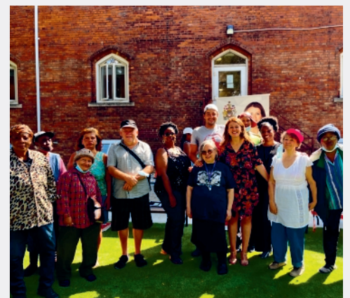
Appreciation ceremony for Bread and Bricks Anti-Poverty Activists