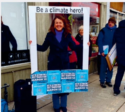
Joining the 350.org rally for climate change