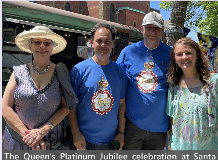
The Queen's Platinum Jubilee celebration at Santa Chiara Park this summer!

Davenport-based individual, non-profit or company that support artists and creators as well as promote arts and culture in general. [There are 3 awards for this category, one each for an individual, a non-profit and a company]