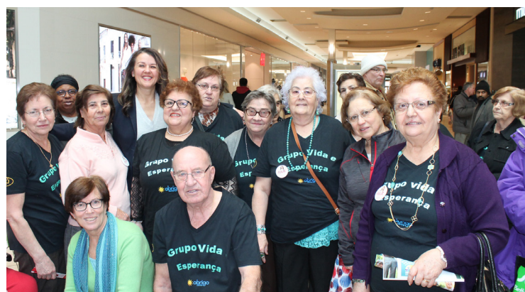
Visit with the Abrigo Centre Seniors Group

Scan here to sign up for MP Julie's bi-weekly email update