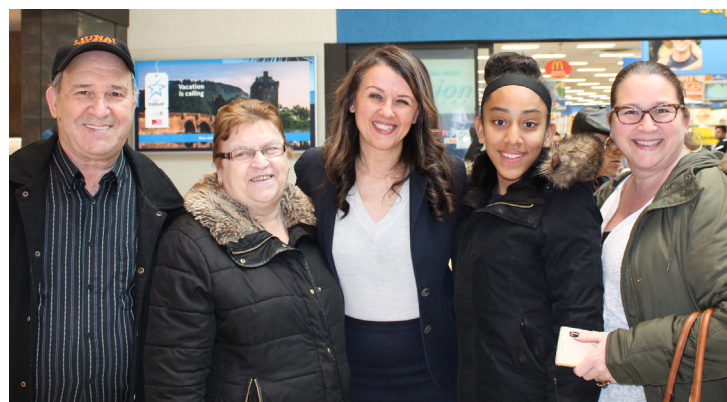
Seniors' day at Dufferin Mall

rcmp-grc.gc.ca/en/seniors-guidebook-safety-and-security