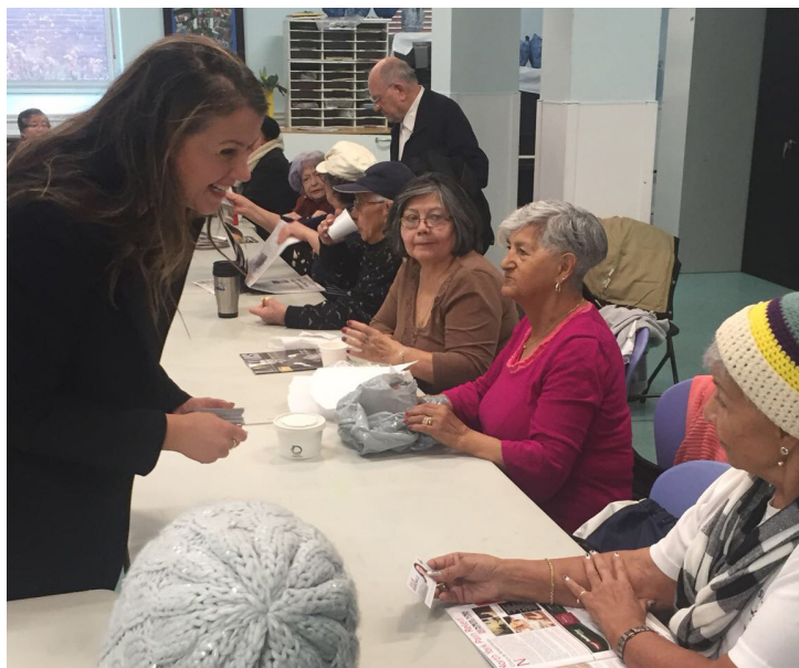
Information session with Spanish seniors at DPNCHC

National Pharmacare: Our government is working with provinces and territories to implement a universal national pharmacare program and are progressing towards a Canada Pharmacare Act by the end of 2023.