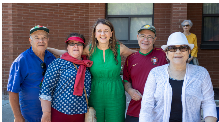
Saying hello to Terra Nova Seniors at the Portugal Day Parade