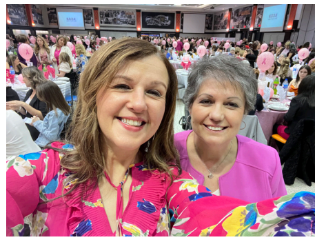
Sticking Together Breast Cancer Fundraiser