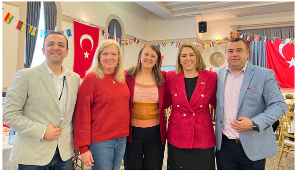
International Children's Day with Turkish Society of Canada