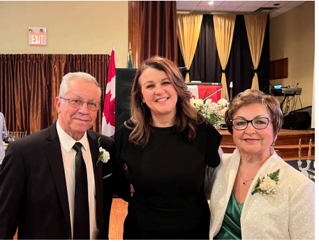
43rd anniversary of Graciosa Community Centre