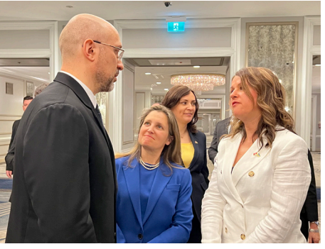
Meeting Prime Minister of Ukraine Denys Shmyhal with Deputy Prime Minister Freeland