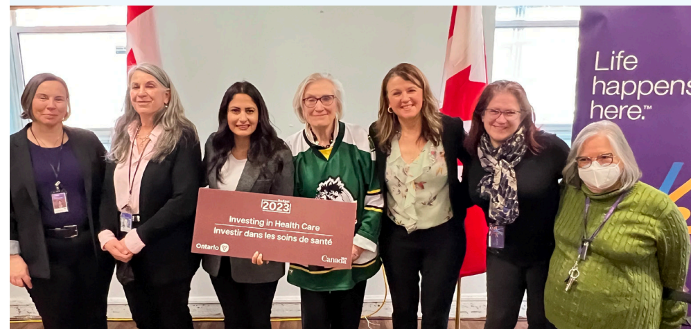
At Davenport-Perth with Minister Khera, Minister Bennett and Executive Director Fraser announcing mental health funding

Visit my website at juliedzerowicz.ca/category/response-to-davenport-letters to read more about federal government direct investments to Toronto in housing, transit, climate change, and infrastructure (including $12.6 billion in federal investment for 89 public transit projects in the City of Toronto since 2016).