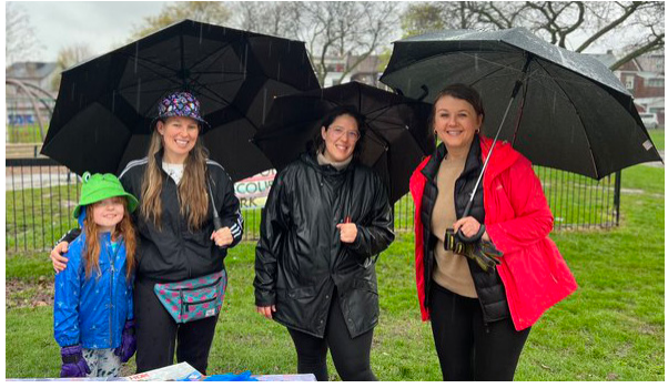
Friends of Earlscourt Park clean-up