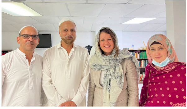
Iftar dinner at the Dawah Centre