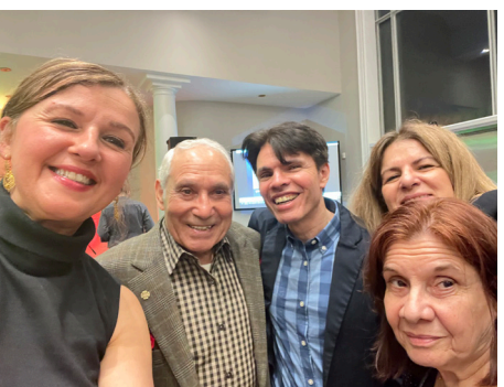
Dia da Liberdade 'Freedom Day'—commemorating the Carnation Revolution