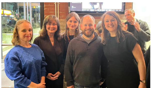
First Métis Man of Odesa play at The Theatre Centre