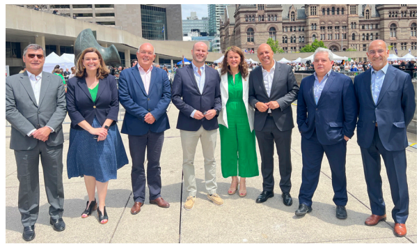
Celebrating 70 years of Portuguese immigration to Canada