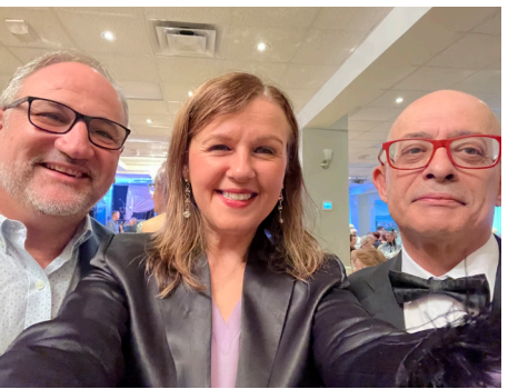
50th anniversary of Asas do Atlantico Sport & Social Club