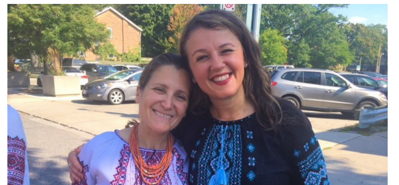
With Deputy Prime Minister and Minister of Finance Chrystia Freeland at Toronto Ukrainian Festival