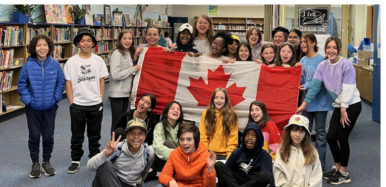
Hanging out with students at Rawlinson Community School!