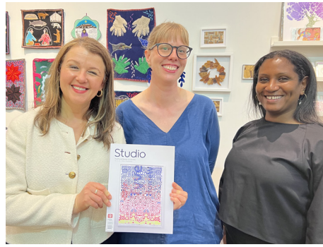
Launch of Craft Ontario Studio Magazine's Summer edition!