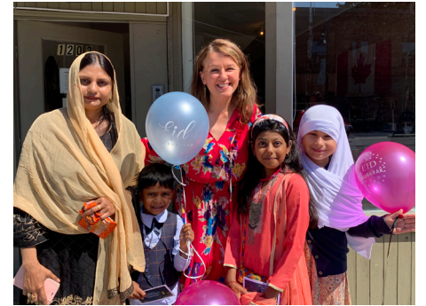
Celebrating Eid al-Adha with the Islamic Culture and Dawah Centre community