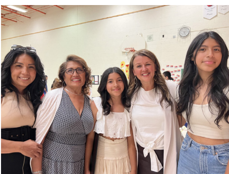
Honoured to have been invited to participate in 13 graduations in Davenport!