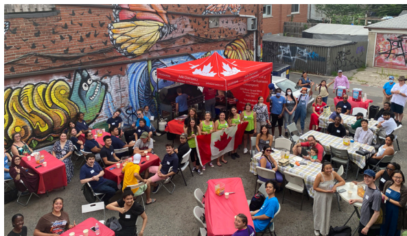
Davenport Canada Summer Jobs BBQ with Davenport-based employers and students. $1.5M, 347 jobs, 106 organizations!