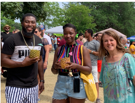
Food, music and fun at BRAZILFEST 2022 at EarlsCourt Park