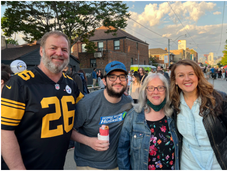
Great to see so many local families at Do West Fest this year!