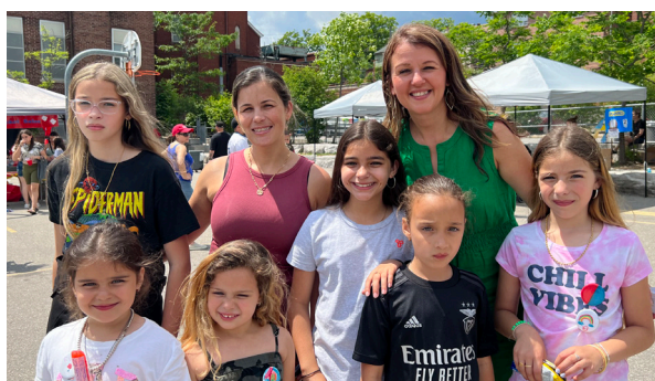
Freezies and games were a great way to stay cool at the St. Mary of the Angels Annual Fun Fair BBQ