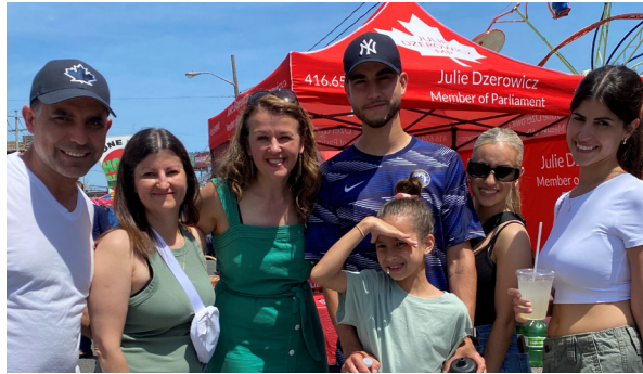
So much fun at the Fairbank Summerfest 2022 saying hello to local residents