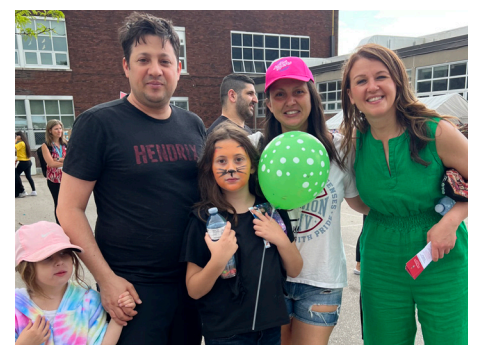
Amazing singing, music, silent auction, games and BBQ at Rawlinson Fun Fair!