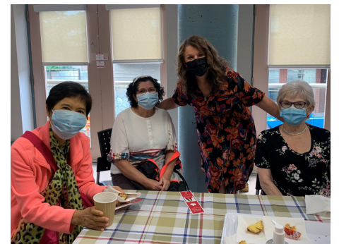
Hosting a Q&A session with the seniors at LA Centre for Active Living!