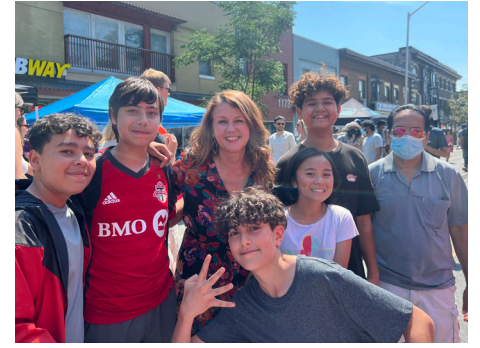
Said hello to over 1500 visitors at this year's BIG on Bloor Festival