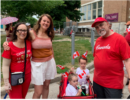
Joining the Annual Canada Day Parade hosted by Regal Heights Residents Association