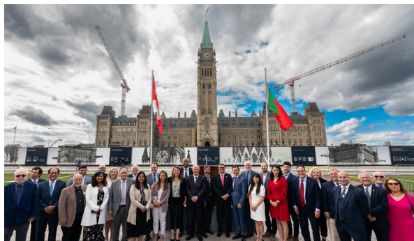
Majestic. Historic. First-ever Portuguese Flag Raising on Parliament Hill to celebrate Portuguese Heritage Month