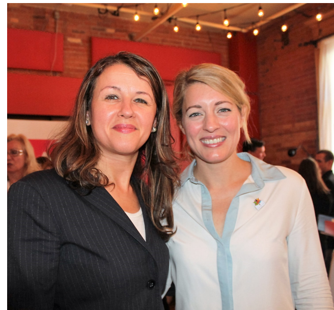
With Minister of Heritage Mélanie Joly at a Canada 150 announcement at Gladstone Hotel