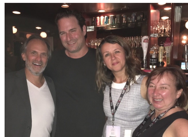
Celebrating songwriting talent at Canadian Music Café