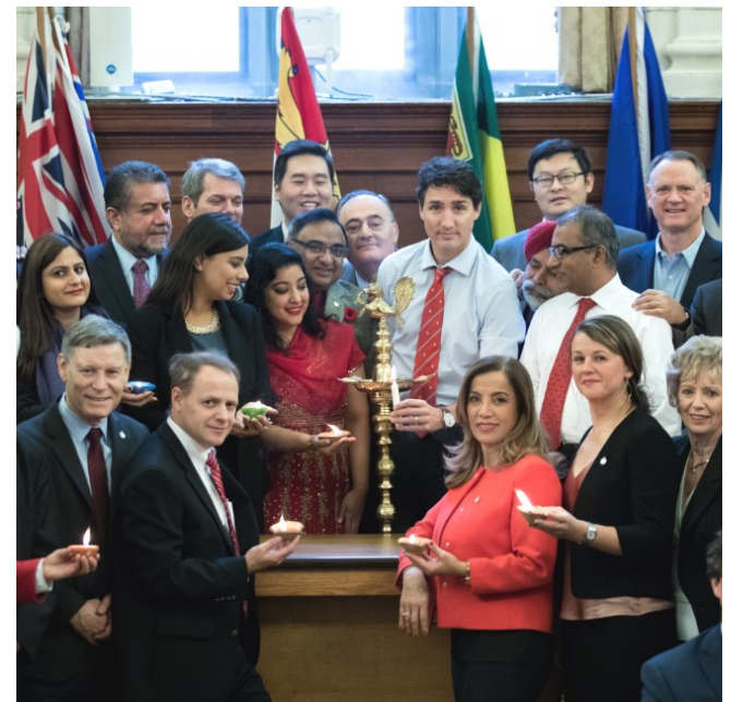
Celebrating Diwali with Prime Minister Justin Trudeau and Liberal Caucus

As always, please do not hesitate to email me, call, or visit my office if I can be of service to you.