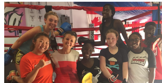
Supporting student summer jobs at MJKO Boxing