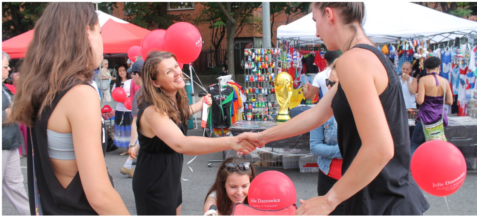
Great to meet community members at Salsa on St. Clair