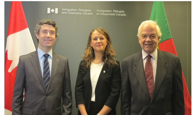
Meeting with Secretary of State of Portugal, José Luís Carneiro, and Immigration Minister John McCallum