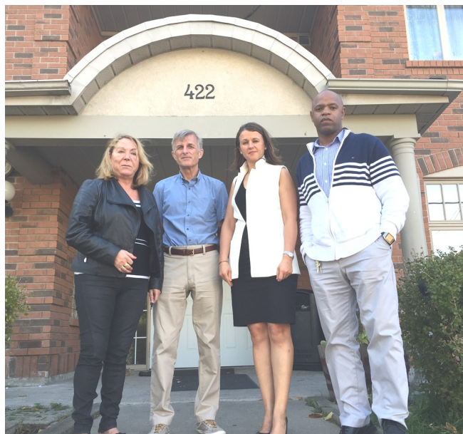
Meeting with Horizons for Youth—local organization that provides transitional housing for disadvantaged youth