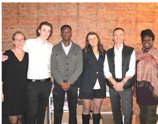
Committed to supporting Canadian content with ACTRA

Citizenship & Immigration (CIC) Passport Canada Employment Insurance (EI) Indigenous Affairs Canada Pension Plan (CPP) Canada Revenue Agency (CRA) Old Age Security (OAS) Canadian Heritage Certificates/Greetings Parks Canada Veterans Affairs Heritage Canada Canada Border Services Agency (CBSA)