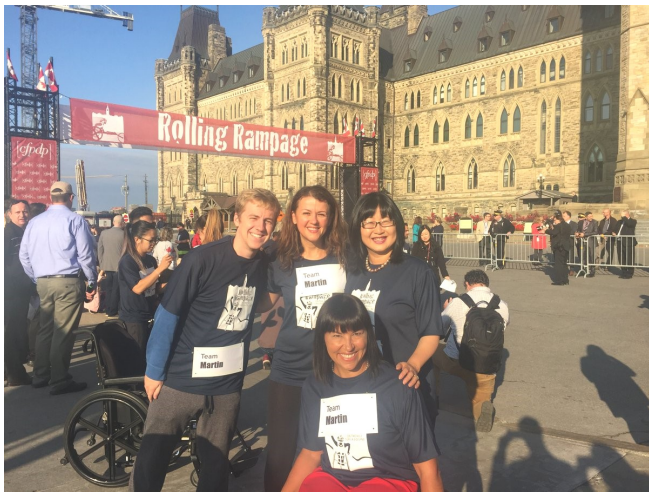
Our team at the Rolling Rampage supporting accessibility

Sadly, 50% of all cases before the Canadian Human Rights Tribunal are related to accessibility. This must change. Julie is a proud campaigner for a more accessible Canada ; one way she showed her support was to participate in the Rolling Rampage Race on Parliament Hill with Paralympian and Senator Chantal Petitclerc. The Race was the kickoff to a day of activities highlighting that people with disabilities are just as gifted and accomplished as their able-bodied peers. For Canada to achieve its potential we need to help every person to succeed. The Minister of Disability and Sport, The Hon. Carla Qualtrough, is currently conducting consultations on a National Accessibility Strategy – to participate in the consultation please visit www.esdc.gc.ca/en