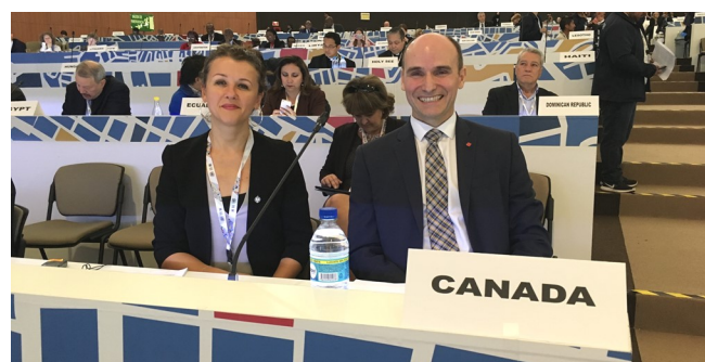
With Minister Duclos at UN Habitat III