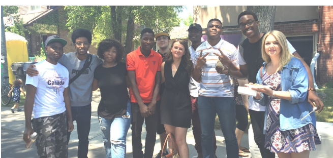
With the amazing youth at the FCJ Refugee Centre Street Party