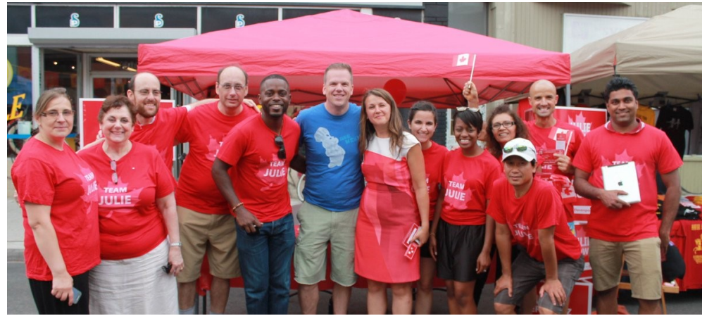
Our amazing volunteers at BIG on Bloor with Mark Holland, MP for Ajax