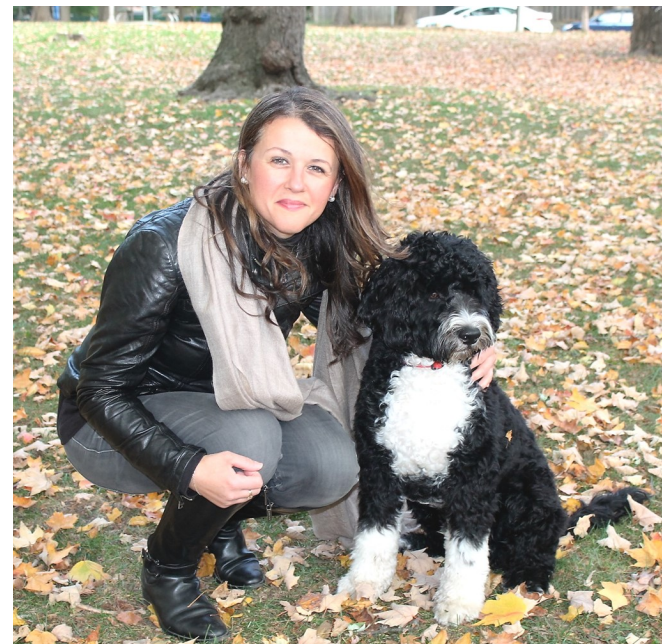
Strong supporter of better laws to protect against animal cruelty