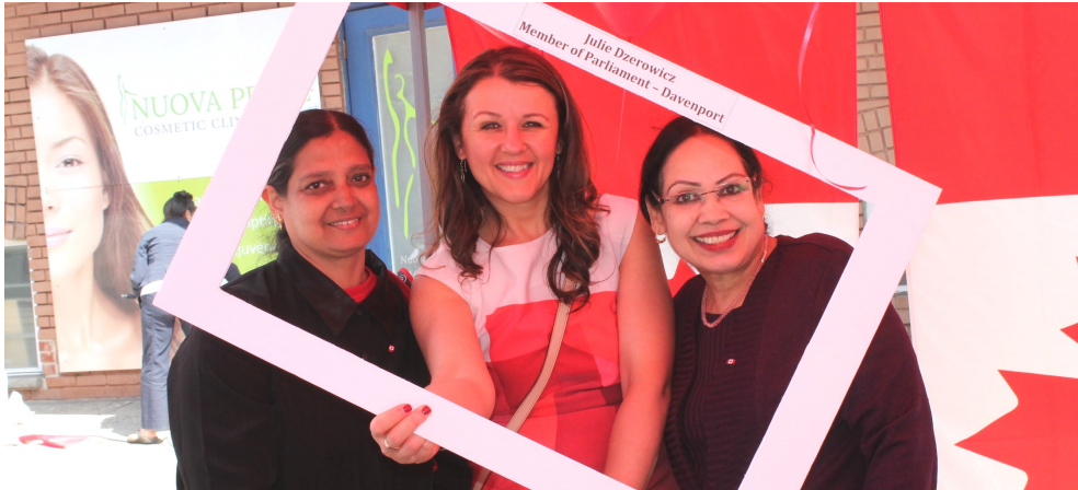
Having fun with local residents at the DuWest Festival