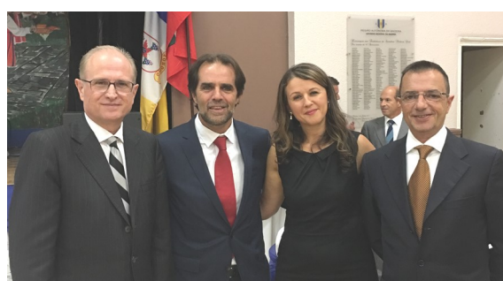
Meeting with the Portuguese Ambassador to Canada, President of Madeira, and Consul General for Portugal