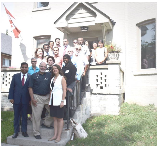
Co-Hosted Refugee Roundtable: local groups FCJ and Adam House participated