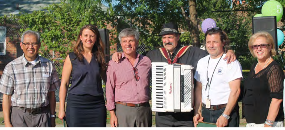
Celebrating the 50th Anniversary of St. John Bosco Catholic High School