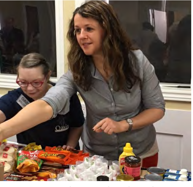
Helping distribute food at the Oasis Centre food bank