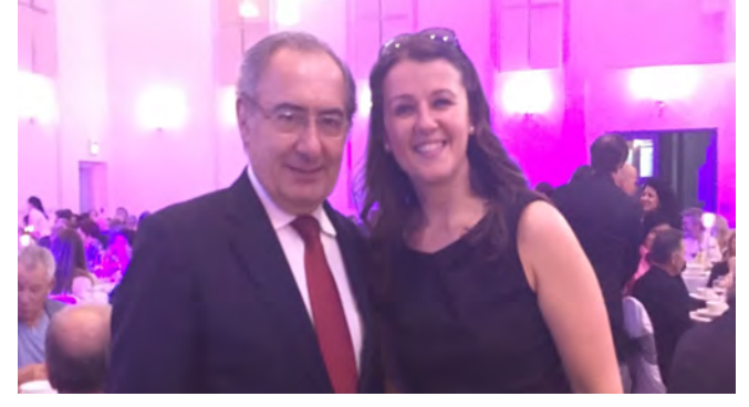
An evening celebrating Fado Music with Portuguese MP José de Almeida Cesário