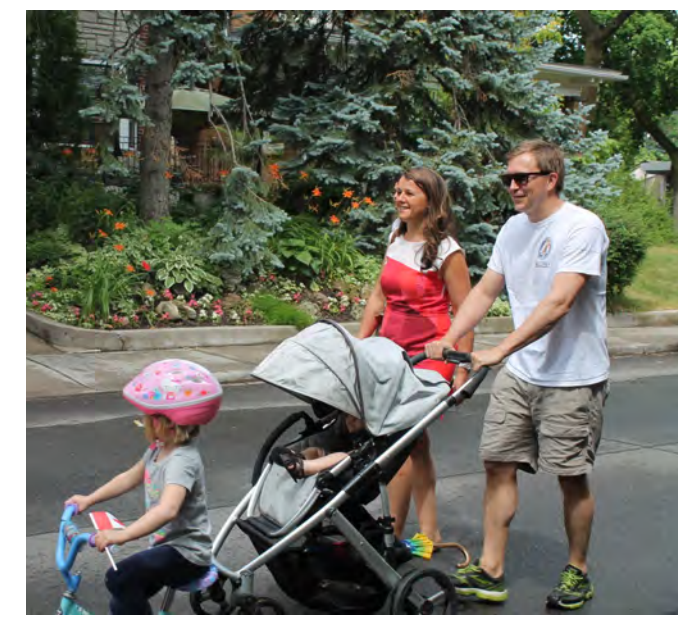
Enjoying the Regal Heights Residence Association Canada Day Parade

The full report can be found in the House of Commons Committees section of the parl.gc.ca website.