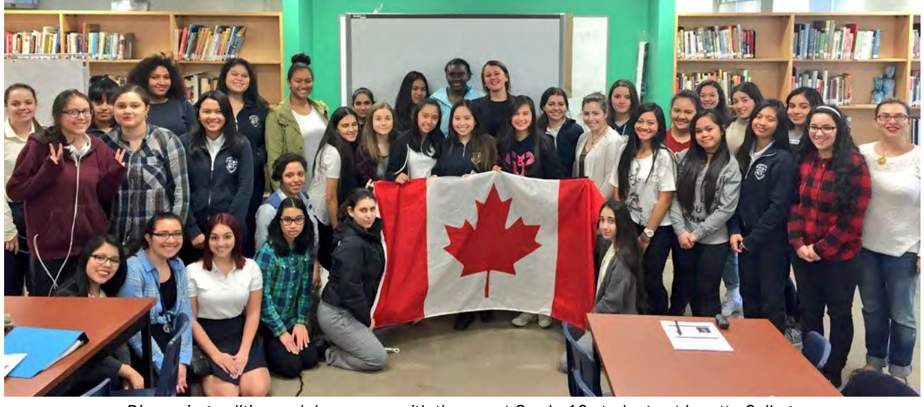
Discussing politics and democracy with the smart Grade 10 students at Loretto College