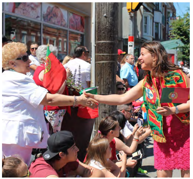
Greeting Davenport residences during the 2016 Portugal Day Parade.