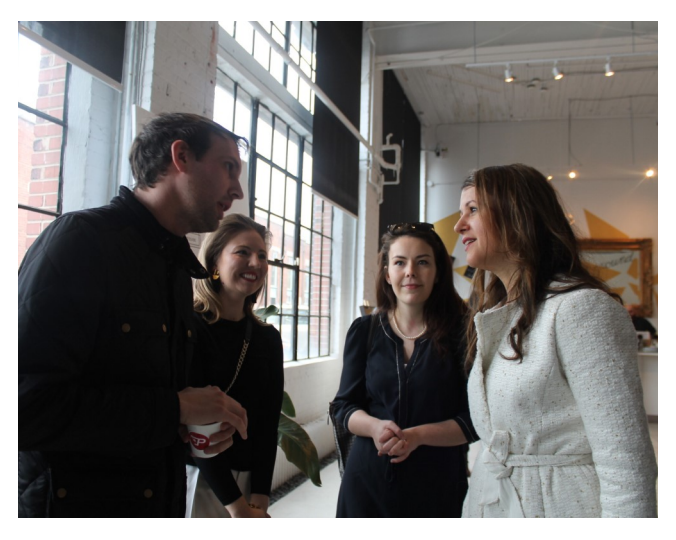
Speaking with local artists at the MOCA announcement

The opening of this space will mark a new era in MOCA's growth, as well serve as inspiration for an already vibrant and rich arts and culture community in Davenport.