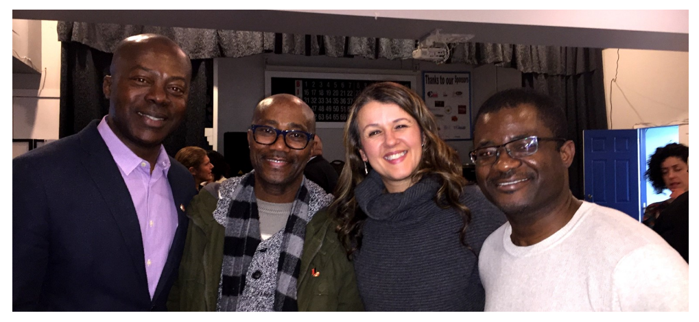
Celebrating Black History Month with Mozambican & Angolan leaders