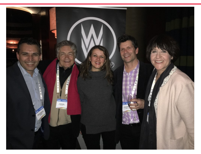
With ACTRA & William F. White Productions

Immigration, Refugees & Citizensh Passport Canada Employment Insurance (EI) Indigenous Affairs Canada Pension Plan (CPP) Canada Revenue Agency (CRA) Old Age Security (OAS) Canadian Heritage Certificates/Greetings Parks Canada Veterans Affairs Heritage Canada Canada Border Services Agency (CBSA)