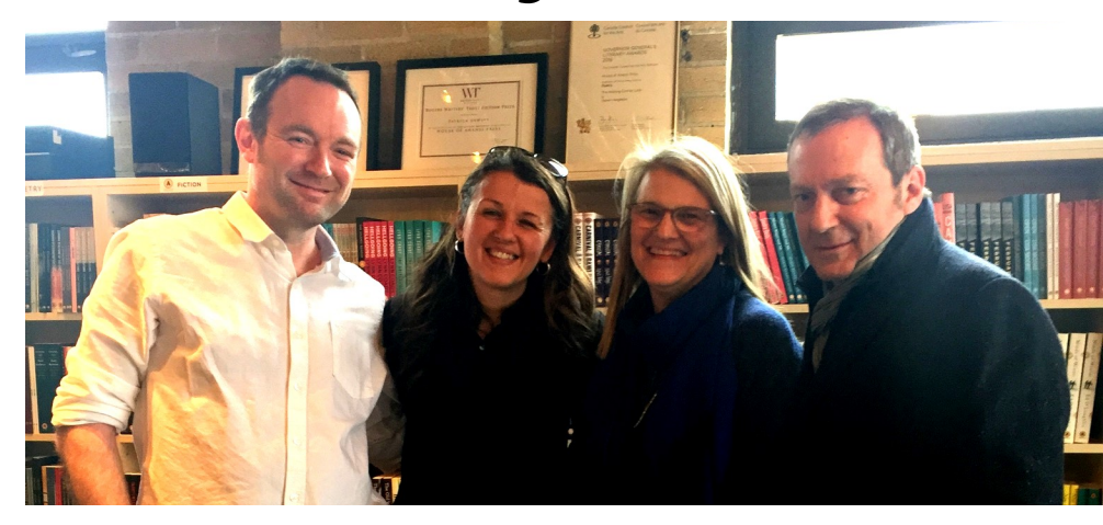
At local publishing house of great Canadian authors, House of Anansi Press