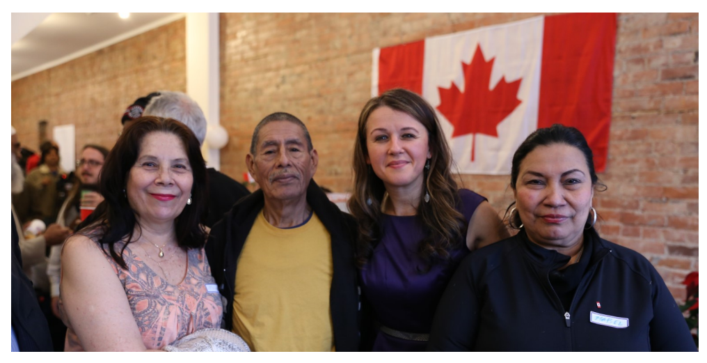
With members of the Ecuadorian community at the Davenport Holiday Party