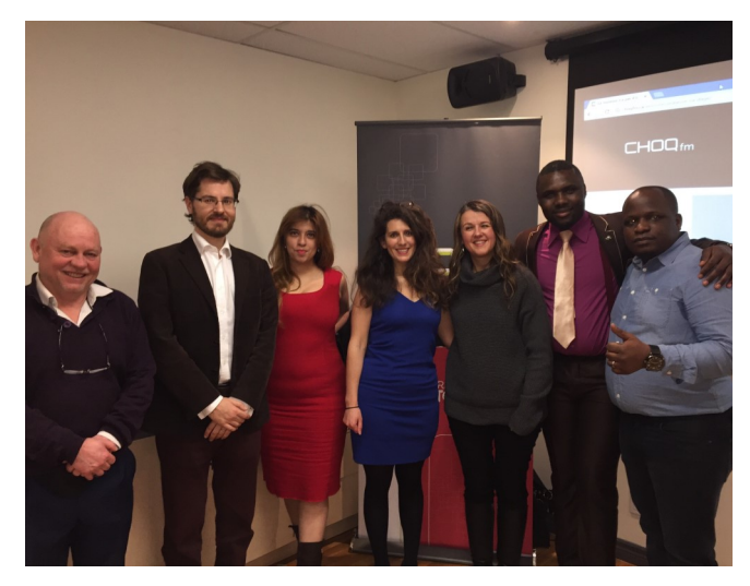
Supporting local French radio station, CHOQ FM