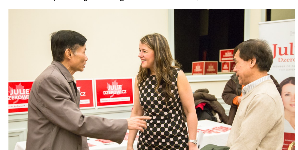
Speaking with Vietnamese community leaders at the Davenport New Year's Levee