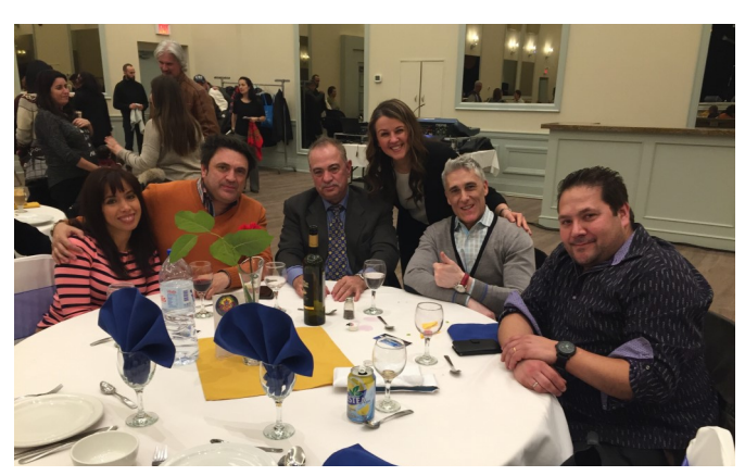
Celebrating the 34th anniversary of Casa do Alentejo