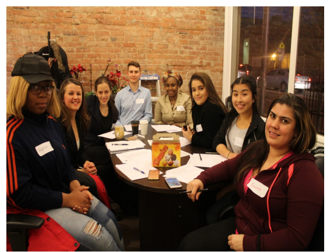
The amazing Davenport Youth Council

The Honourable Jean-Yves Duclos has launched a public consultation process so that all approaches to reduce poverty across the country are considered. Canadians are invited to participate in the online consultation, which will run until June 2017. For more information please visit <a href="https://www.canada.ca/en/">https://www.canada.ca/en/</a>