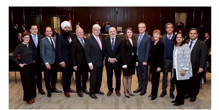
With EU Parliament Civil Liberties Committee