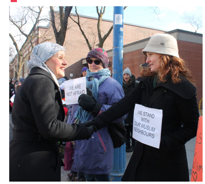
Thanking residents for the Ring of Peace at the Dawah Centre