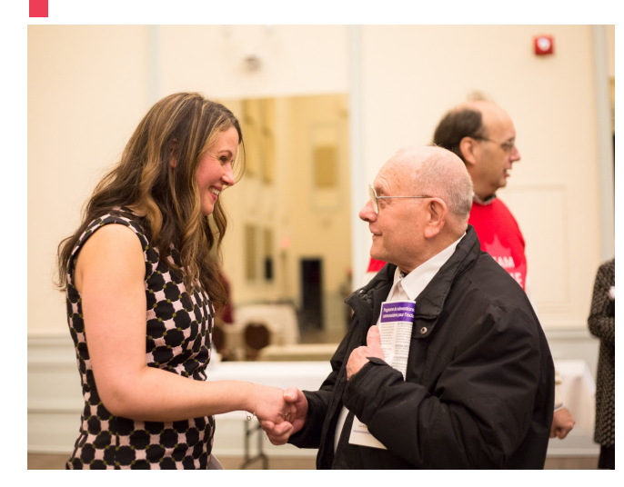
Saying hello to local resident at New Year's Levee