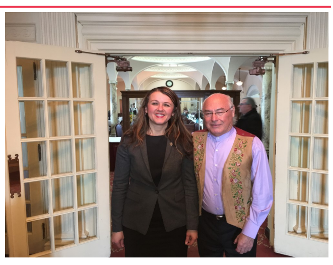
With Clément Chartier, Pres. of Métis National Council