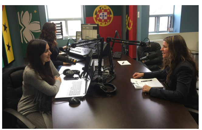
Discussing federal issues during monthly interview with Brazilian Camões Radio

aniversário da Casa das Beiras, no trigésimo quarto aniversário da Casa do Alentejo, na angariação de fundos para o cancro da mama na Amigas de Toronto, no Festival das Concertinas com o Arsenal do Minho, e no First Portuguese Community Centre.