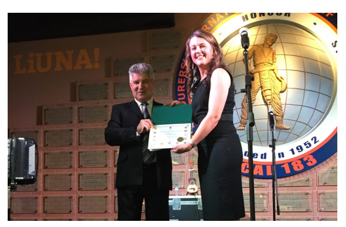
Presenting a certificate to Casa das Beiras on their 17th anniversary