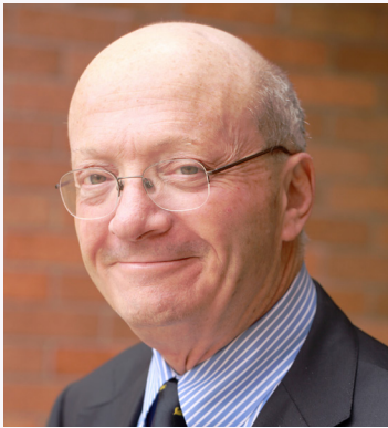
The Hon. Hugh Segal, former Ontario Senator

“Even before the pandemic, the various levels of government in Canada spent tremendous amounts of money to send cash to Canadian families in an effort to reduce poverty. The PBO has just demonstrated that if we spent that same amount of money a little bit better by consolidating these cash transfers into a basic income, we could reduce the poverty rate by 49% with no new taxes, no increase in tax rates and no cuts to public services. The task is not simple, but we owe it to ourselves—to our families and neighbours and friends—to think carefully about how we might deliver a basic income.”