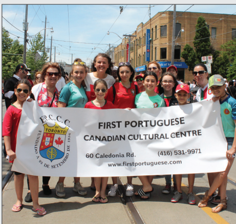
Marching in the 2018 Portugal Day Parade on Dundas Street West - with the First Portuguese Canadian Cultural Centre