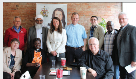
Davenport's faith leaders roundtable discussion