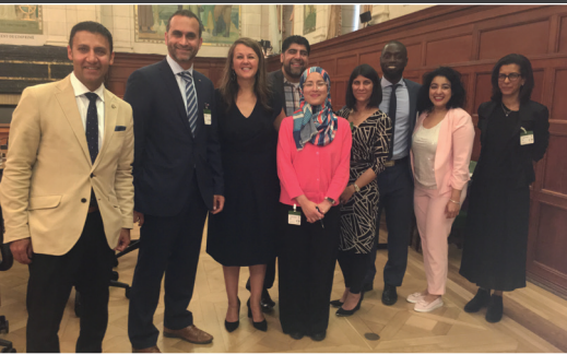
Meeting with Muslim leaders to talk about systemic discrimination