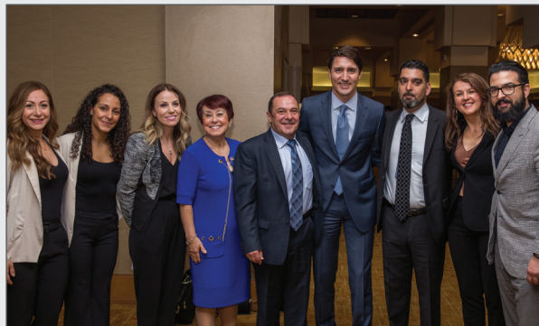
At the Economic Club with Prime Minister Justin Trudeau and Davenport business owners – the Macedo and Tavora families