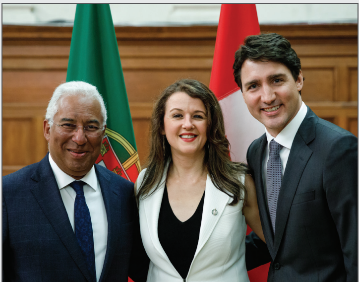
With Prime Minister António Costa of Portugal and Prime Minister Justin Trudeau on Parliament Hill