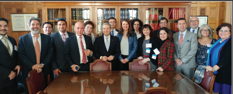
Top 10 Hispanic Canadians’ visit to Parliament Hill with International Trade Minister François-Philippe Champagne & Chief Government Whip Pablo Rodriguez