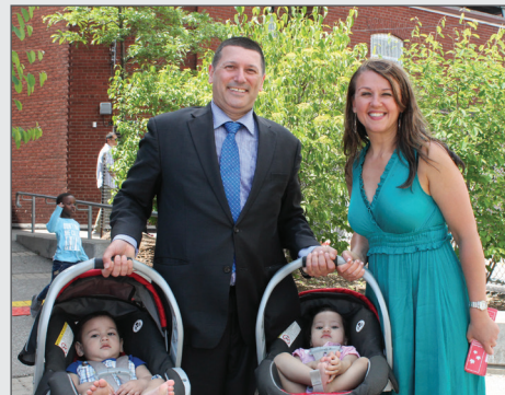
At the 2018 St. Mary of the Angels School Fun Fair