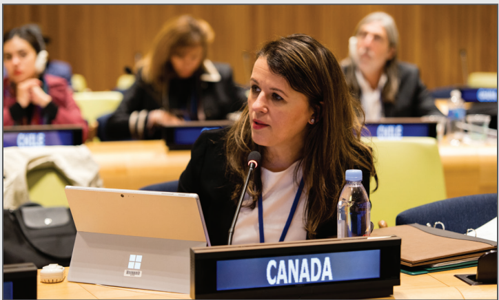
Representing Canada at the Inter-Parliamentary Union Meeting