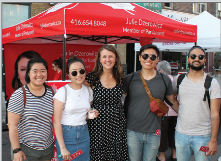
At DuWest Fest saying hello to local youth

We have an obligation to our kids to take care of our planet, and it’s an obligation we as a federal government are determined to fulfill.