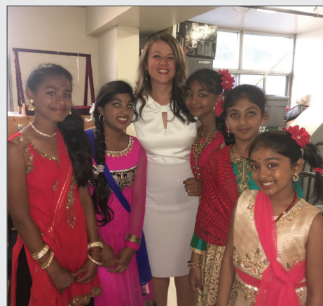
With talented performers at the Tamil Co-op for the Tamil and Burmese New Year celebrations