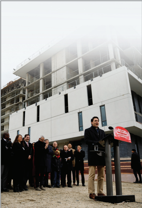
With Prime Minister Justin Trudeau at the National Housing Strategy announcement