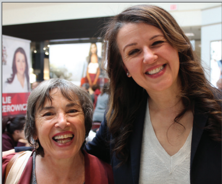
Hosting a Seniors Information Session at Dufferin Mall

Though there’s more work to do, here are some concrete changes our federal government has made that are making a positive difference in the lives of our seniors. We have returned the retirement age from 67 back to 65, and have restored the age of eligibility for Old Age Security (OAS) and the Guaranteed Income Supplement (GIS). This means 900,000+ seniors are now receiving enhanced GIS benefits (up to an additional $947 per year). We are helping seniors receive home care services and stay independent longer by investing $11 billion over 10 years in dedicated funding for mental health and home care services, with $4.2 billion allocated to Ontario. We’ve enhanced the Canada Pension Plan (CPP) to increase the maximum level of pension earnings to 14 per cent. Finally, we are creating new affordable housing units and repairing existing ones – targeting seniors – through the National Housing Strategy.