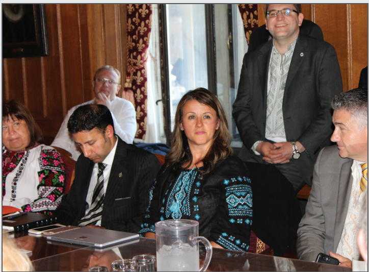
Historic first working meeting between the Canada-Ukraine Parliamentary Friendship Group and the Ukraine-Canada Parliamentary Friendship Group

Davenport is home to the largest Portuguese community in Canada. As such, it was an honour to join Prime Minister Justin Trudeau in welcoming Portuguese Prime Minister António Costa to Canada. The focus of the visit was to build stronger relations between our two countries and to increase trade via the recently signed Canada Europe Trade Agreement (CETA). Indeed, Prime Minister Justin Trudeau highlighted the success of a number of small Portuguese-Canadian businesses who will benefit from CETA – including two companies from Davenport: Macedo Winery and Tavora Foods.