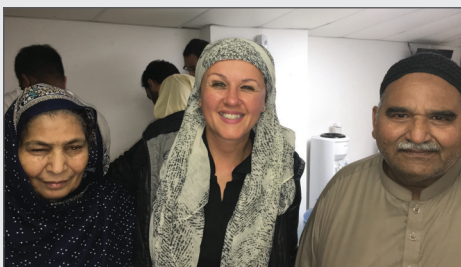
Breaking fast with the Muslim community at the Islamic Information & Dawah Centre