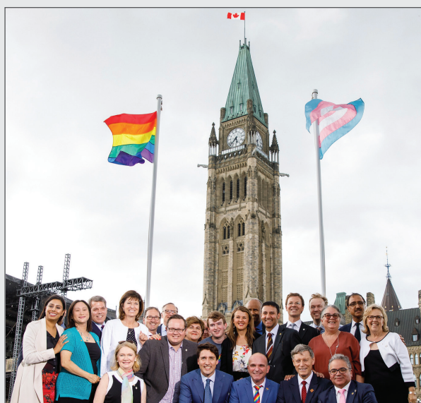
Raising the Pride and Transgender flags on Parliament Hill with Prime Minister Justin Trudeau and colleagues