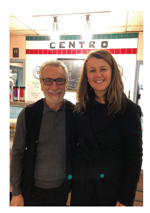
VISITING A LOCAL ITALIAN BUSINESS: CENTRO TRATTORIA & FORMAGGI

There will be more announcements on sector-specific support in the coming days and months. Please visit juliedzerowicz.ca/coronavirus for links to my Daily Updates or sign up to receive my Daily Update by email at juliedzerowicz.ca/email-updates .