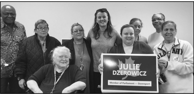
"Meet our MP" session with the residents of 1884 Davenport Ave.