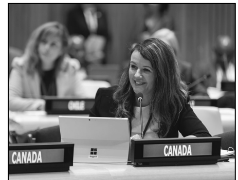
Representing Canada at the UN in New York City, speaking on Global Migration & Refugees*