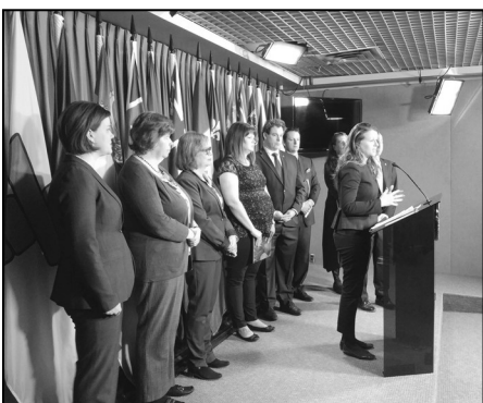
Speaking in support of MP Anthony Housefather's upcoming private members bill to decriminalize donor sperm and surrogacy in Canada