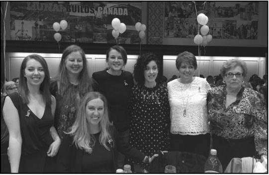
Supporting Amigas de Toronto and Poveiros Club - Breast Cancer Fundraiser at LiUNA 183