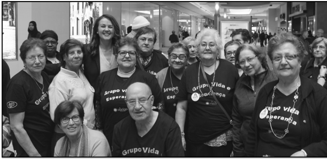
Hosting a well-attended, popular Seniors Information Session at Dufferin Mall