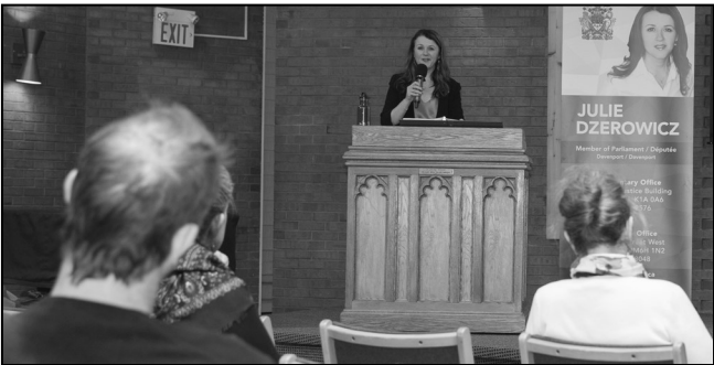
Federal Budget 2018 Breakfast Town Hall at New Horizons

The federal government is serious about preserving the beauty of Canada’s nature for future generations to come, tackling climate change, and creating clean growth and jobs for the middle class. We will be investing $1.3 billion in the environment to protect our ecosystems, landscapes, biodiversity, and species at risk.