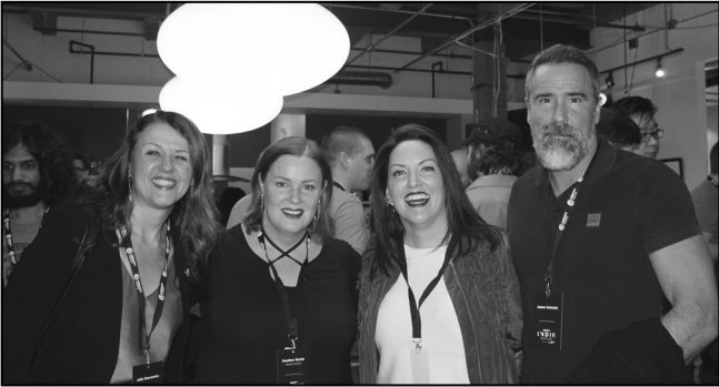
At the Davenport-based video game publisher - Ubisoft Toronto Indie Series Awards