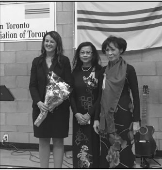
Proud to speak at the Vietnamese Women’s Association of Toronto Women’s Day event

The 2018 Federal Budget takes concrete steps to increase women’s participation in the workforce. Child care duties continue to fall disproportionately to mothers. The new ‘use it or lose it’ parental benefits will give families up to eight weeks more in parental benefits if new fathers/second spouses take parental leave. This incentive will allow women to return to work sooner if they choose.