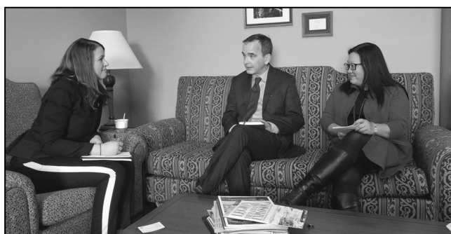
Discussing the importance of supporting Canadian content creation - with the CBC