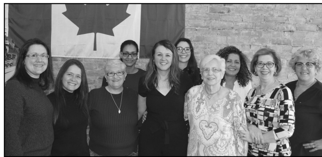
Discussing local issues with leaders at the Brazilian Women's Roundtable