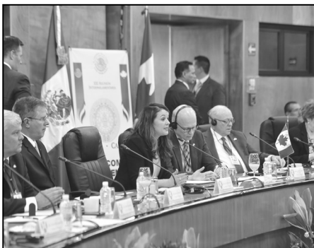
In Mexico City, on a formal Canadian Delegation building Canada-Mexico relations