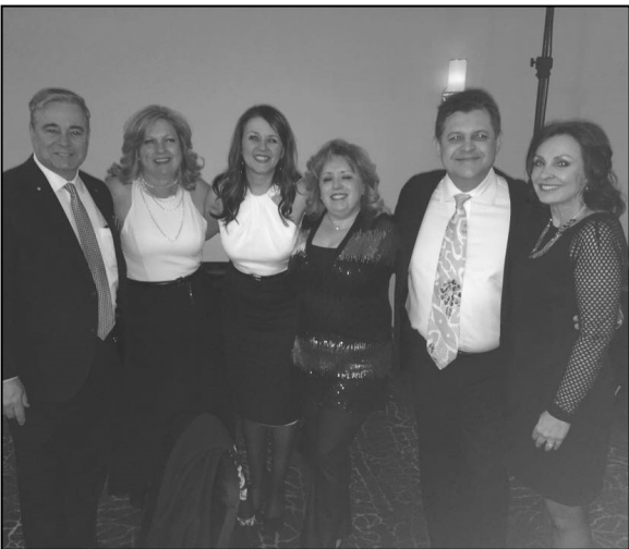
36º Gala Annual de Bolsa de Estudos da Federação de Empresários e Profissionais Luso-Canadianos Federation of Portuguese Canadian Business & Professionals’ (FPCBP) 36th Annual Scholarship Gala

E por último, este ano, pela primeira vez, vamos reconhecer Junho como Mês do Património Português e o 10 de Junho como Dia de Portugal no Canadá. É graças à liderança das colectividades portuguesas e a todos os vossos esforços no sentido de preservar a língua, cultura e tradições portuguesas que pude apresentar esta moção na Câmara dos Comuns, onde foi aprovada por unanimidade. Parabéns a todos. Aguardo com expectativa os momentos em que nos poderemos reunir para festejar essa ocasião tanto em Toronto como em Otava! Como sempre, é para mim uma honra representar a comunidade portuguesa em Ottawa e trabalhar arduamente em nome de todos, para criar uma comunidade e um país ao qual nos sintamos orgulhosos de pertencer.