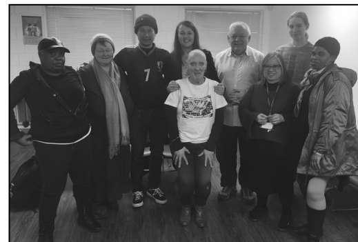
Meeting with the Davenport "Bread & Bricks" group to discuss poverty issues