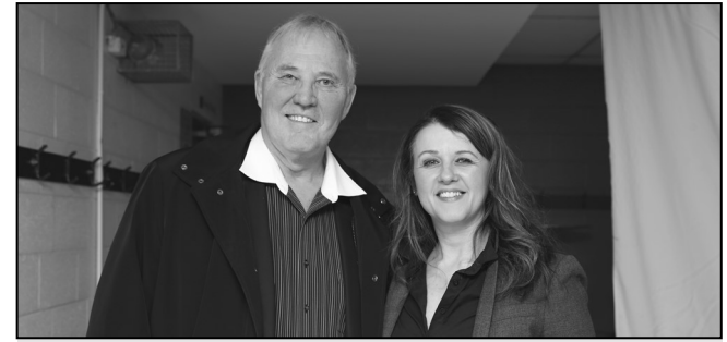
At JJ Piccininni Community Centre hosting a Davenport Marijuana Town Hall with special guest MP Bill Blair