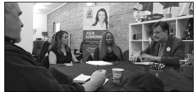
Hosting a Davenport Small Business Roundtable to hear from local business owners