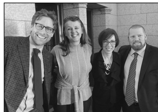
Meeting with members of the Canadian Media Producers Association in Ottawa