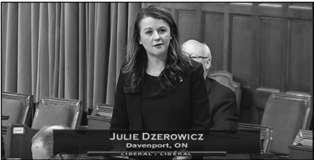
Delivering statement in the House of Commons on gender equity and Budget 2018 To view: jdzerowicz.liberal.ca