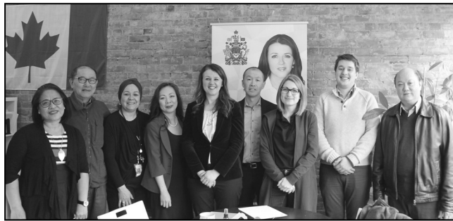
Meeting with members of Davenport's Filipino, Vietnamese, Korean, & Chinese communities