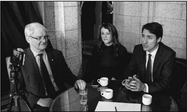
With PM Trudeau & Transport Minister Marc Garneau on Facebook Live, speaking about the voting marathon in the House of Commons