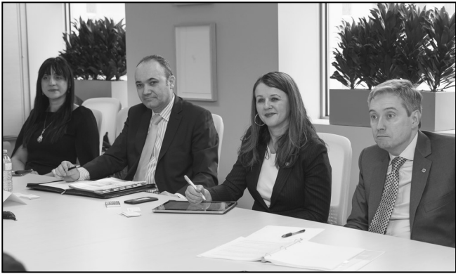
MERCOSUR Roundtable Discussions with International Trade Minister François-Philippe Champagne