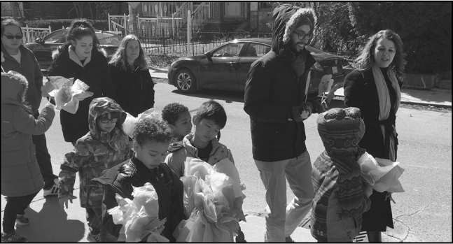
Having fun at the Dovercourt Boys & Girls Club's Annual St. Patrick's Day Parade