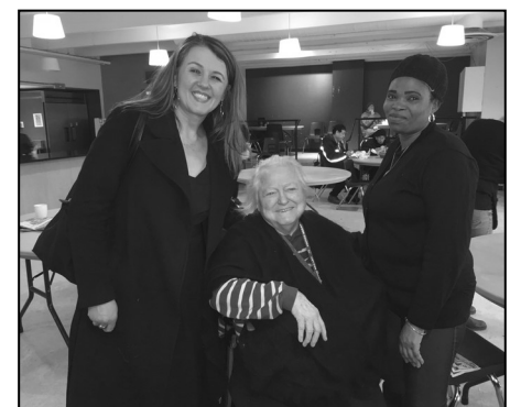
Chatting with local residents and leadership of the local, award-winning "The Stop" Community Centre