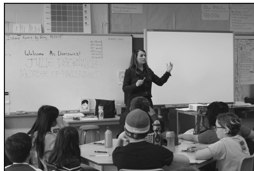
Answering super-smart questions from students at Shirley St. Public School - Grade 5 class