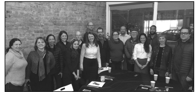
Productive Davenport Arts & Culture Strategy Session – with local artists and creators