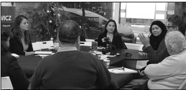
Meeting with the leaders of the Hispanic/Latin American Community discussing how best to serve those in Davenport