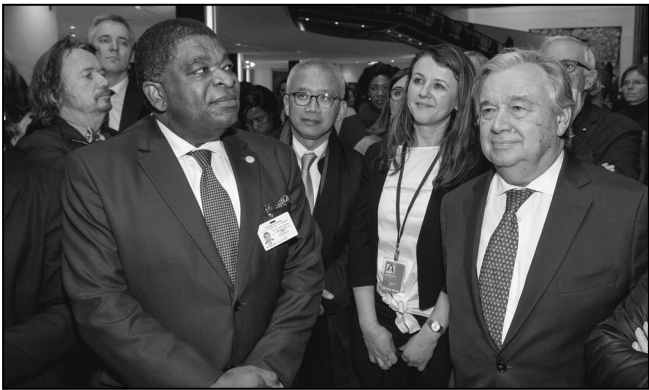
At the UN representing Canada on Global Migration & Refugees, with Secretary-General António Guterres*