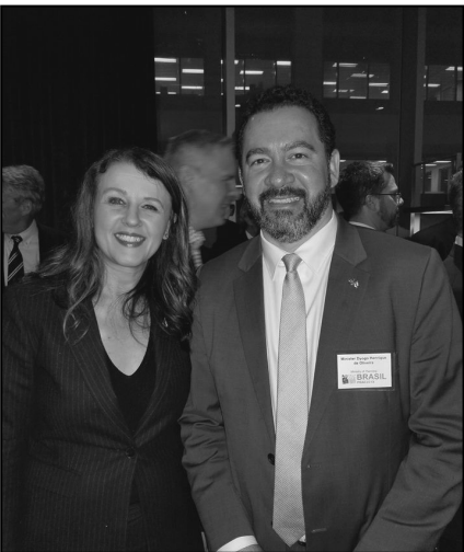
Encontro com o Ministro do Planeamento brasileiro Dyogo Henrique de Oliveira em Toronto / Meeting Brazilian Minister of Planning Dyogo Henrique de Oliveira in Toronto