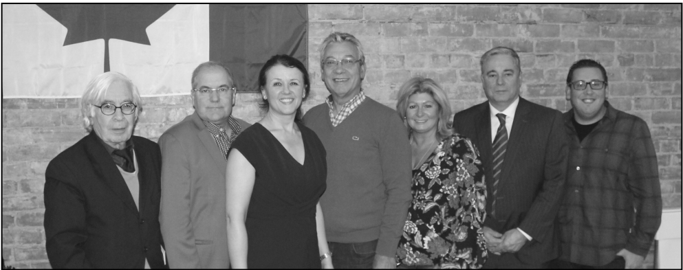
Mesa redonda sobre prioridades na comunidade com Líderes Portugueses / Roundtable discussion with Portuguese leaders on community priorities

Olá a todos da comunidade portuguesa de Davenport. Há tanto para partilhar convosco, começando pela visita ao Canadá do Primeiro-Ministro de Portugal , António Costa, que estará em Toronto com o Primeiro-Ministro do Canadá, Justin Trudeau, no dia 4 de Maio. Além de se virem encontrar com líderes da comunidade lusa e da diáspora ao longo do dia, a finalidade da visita é também de estabelecer melhores relações entre os dois países e de ver como ambos poderão tirar partido do CETA para benefício mútuo.