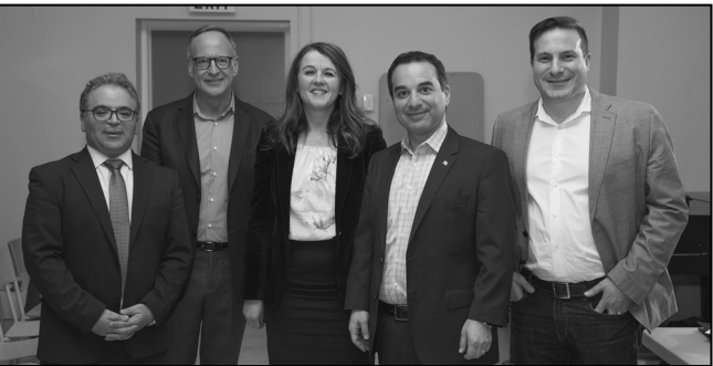
Co-Hosting Pre-Budget 2018 Consultations with MPs Michael Levitt, Marco Mendicino, Rob Oliphant, and Francesco Sorbara

Several families in Davenport required my assistance when their child’s name was wrongly added to the “No-Fly” List because they share a name with someone who is a potential security threat. The federal government will invest $81.4 million over 5 years to ensure families aren’t impacted unfairly by the “No-Fly” list.