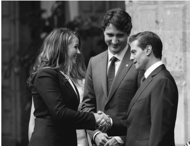
Invited to join PM Justin Trudeau on his State Visit to Mexico - with Mexican President Enrique Peña Nieto.