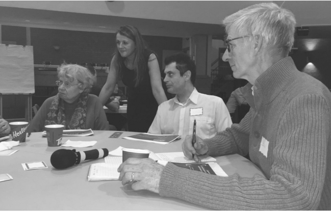
Hearing from Davenport residents during the 2018 Pre-Budget Consultation.