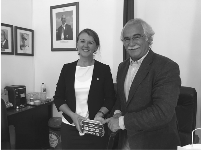
In Peniche, with Mayor of Peniche - Presidente Antonio Jose Correia.

M-126 passed third reading unanimously on November 8, meaning that every Party and Member of Parliament voted to recognize the important contributions that the Portuguese community has made to Canadian society. With over 110,000 views on Facebook (from Australia to Newfoundland and everything in between!), great pride was shown by the Portuguese for this recognition all around the world!