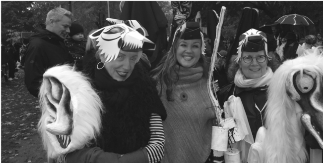
Night of Dread with Dufferin Grove Community.