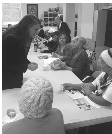
Chatting with Spanish seniors at the Davenport-Perth Community Centre.