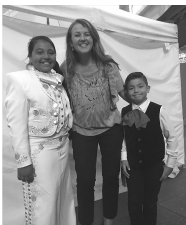
Celebrating Mexican Independence Day.