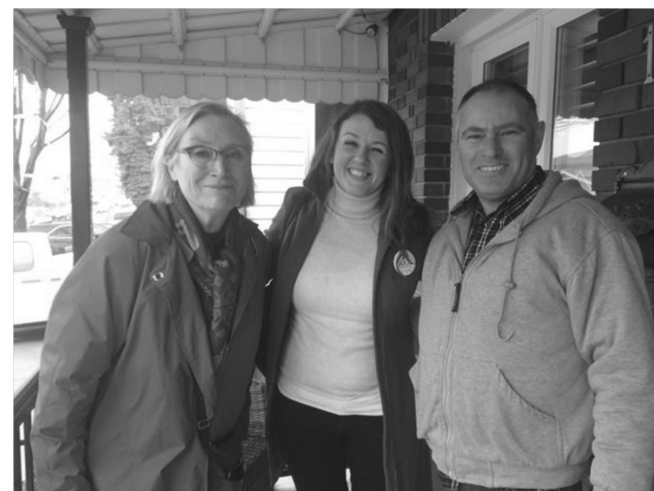
Canvassing in the northern part of Davenport with the Hon. Carolyn Bennett!

The most rewarding part of my job as your Member of Parliament is having the chance to help you, to make your lives better, to help our community be better, and to do my part to create a better Canada. Should you have any questions, or if there are any issues you want to discuss, and/or if there is support I may be able to provide - please do not hesitate to contact me at either my Toronto or Ottawa office.