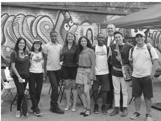
Loved meeting all students employed in Davenport at my first summer BBQ!