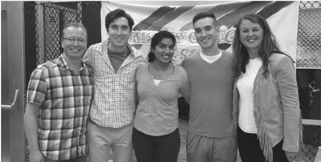
With the amazing cast of Roseneath Theatre's production of 'Outside.'