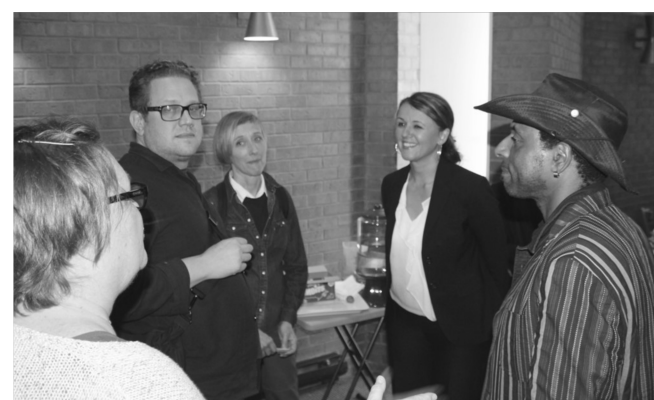
Talking to local artists at the Davenport Art Funding Information Session.