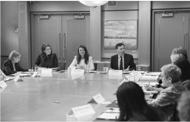
Joined Minister Bill Morneau and gender budgeting experts for a 2018 Pre-Budget roundtable.