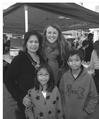
With local residents at the Fairbank Village BIA Pumpkin Giveaway.