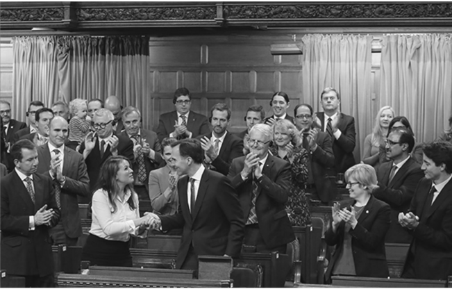
In the House with Finance Minister Bill Morneau after his reading of the Fall Economic Statement.

Finally, I was proud to join Minister Morneau in a consultation with gender budgeting experts to help gain concrete, applicable ideas to increase the gender lens in Budget 2018.