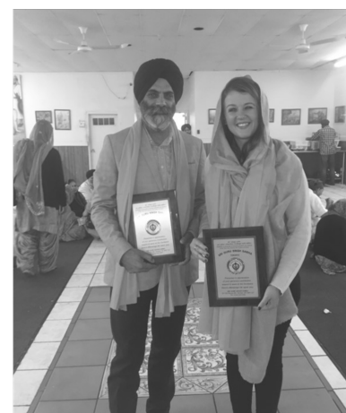
Post-Diwali celebrations at the Weston Road Gurdwara.