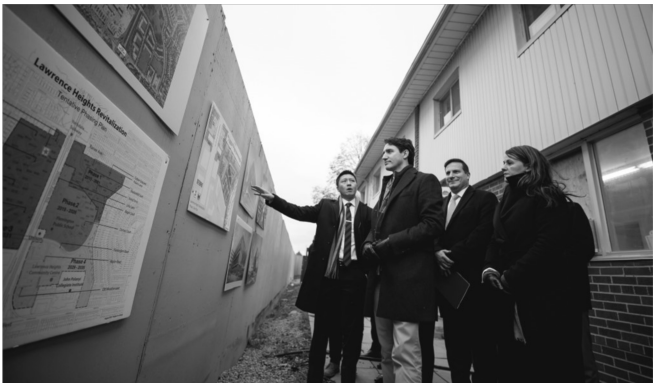
Proud to be at the National Housing Strategy announcement with Prime Minister Justin Trudeau.