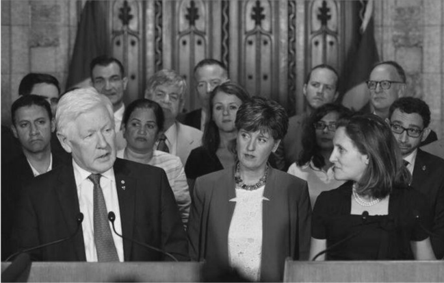
Proud to stand with Ministers Bibeau and Freeland during the announcement of the Hon. Bob Rae being appointed Special Envoy to Myanmar.