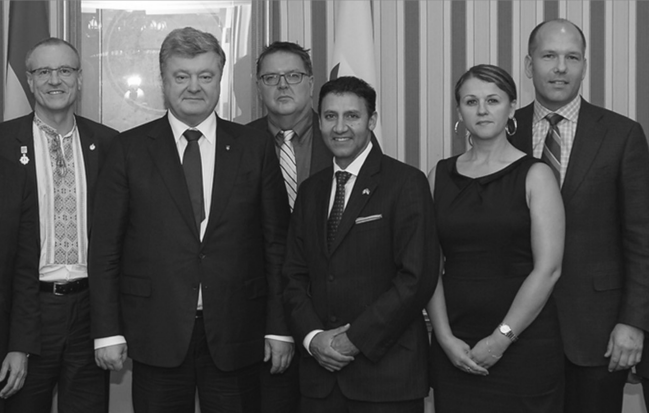
Meeting with Ukrainian President Poroshenko and fellow MPs asking how Canada can help strengthen Ukraine's democracy.