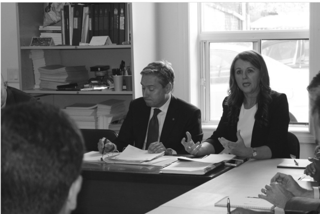
Business Roundtable with the Brazilian community & special guest Hon. François-Philippe Champagne, Minister of International Trade.

The Minister updated all on the NAFTA negotiations and other trade agreements that Canada is focusing on including the Asia-Pacific region (TPP11), and potentially working on a trade agreement with China and with Latin America by joining MERCOSUR (trade with Argentina, Brazil, Paraguay and Uruguay). Productive and important discussions were held on how MERCOSUR would work and how to strengthen ties between Canada and Brazil.