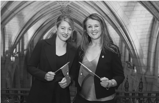
Celebrating unanimous passage of my Private Members Bill (Portugal Heritage Month) with Minister Mélanie Joly.