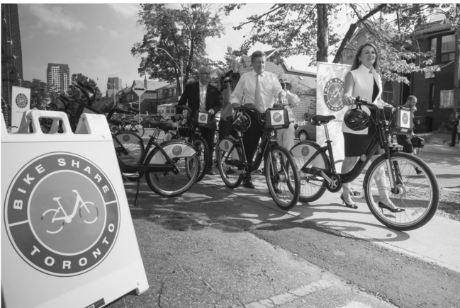
Bike infrastructure announcement with Mayor John Tory and Provincial Transportation Minister, the Hon Steven Del Duca.

I hope many Davenport residents take advantage of these new bike stations in Toronto, whether it be to commute or just for fun!