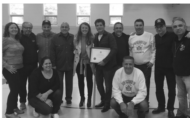
At the Dovercourt Boys & Girls Club Fall Harvest presenting a certificate honouring the Club's 60th Anniversary.