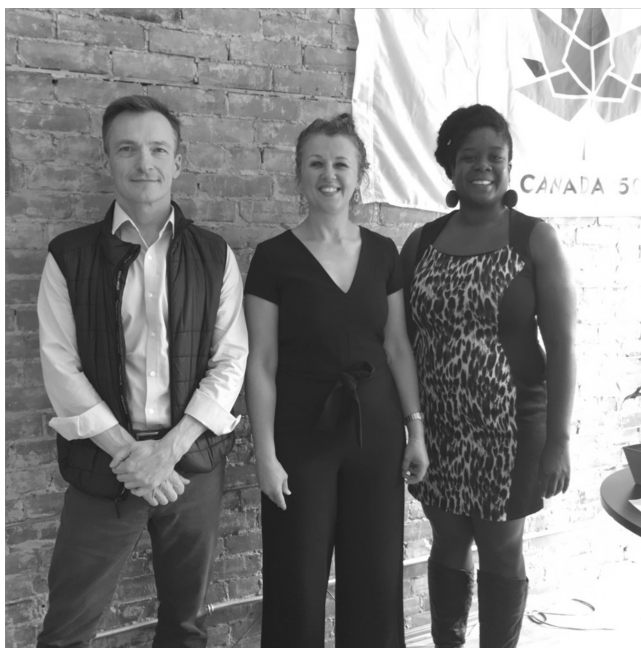
Meeting with local talented actors and members of ACTRA!