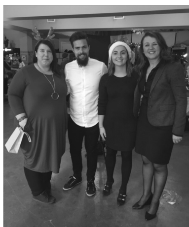
Supporting the First Portuguese Cultural Centre Christmas Market - and getting into the Christmas Spirit!