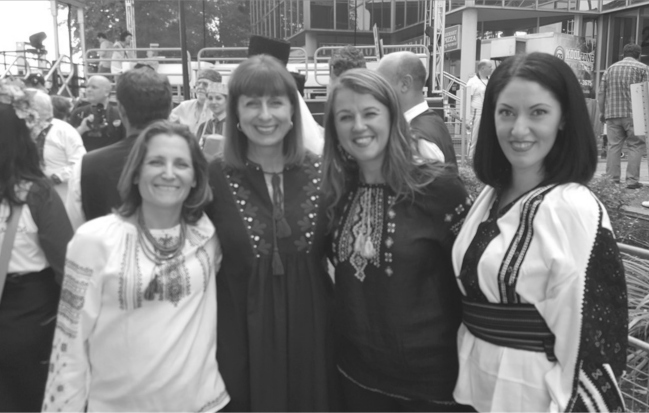
With Minister of Foreign Affairs Chrystia Freeland, Alexandra (Lesia) Chyczij, and Anna Kuprieva at the Bloor Street Ukrainian Festival.

Having more women in UN missions could also be a helpful way to combat the problem of sexual abuse by UN troops – allegations that have rocked the UN for over a decade. And research has shown that local populations are more likely to report incidences of abuse and exploitation to woman peacekeepers.