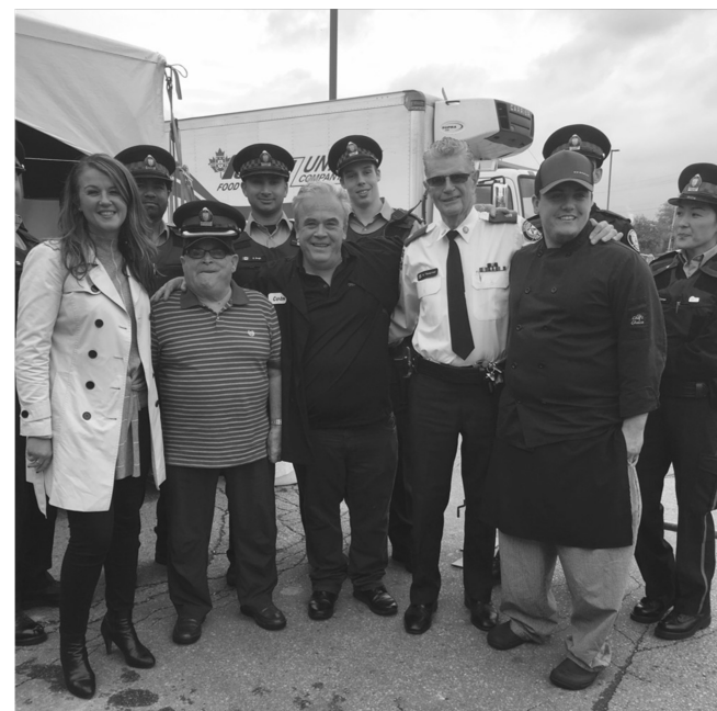
Presenting a letter from the PM at a fundraiser at Martins Churrasqueira to raise money for GPS bracelets for those with Alzheimers & dementia.