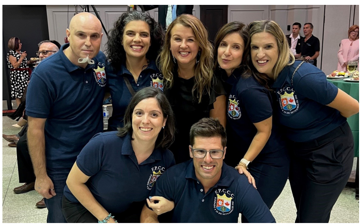
With First Portuguese Canadian Cultural Centre celebrating the visit of the President of Portugal Rebelo de Sousa at LiUNA Hall