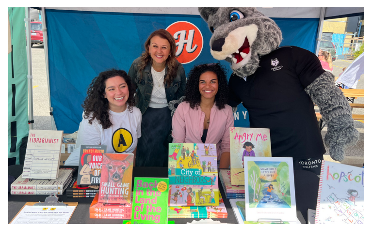
At Henderson Brewing's annual Sterling Road Block Party visiting the House of Anansi-Groundwood Books booth