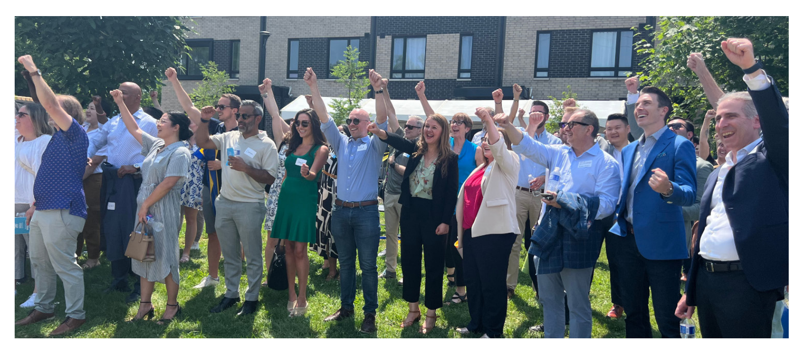
Welcoming 22 families to Habitat for Humanity homes in Davenport!