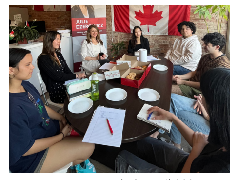
Davenport Youth Council 2024!