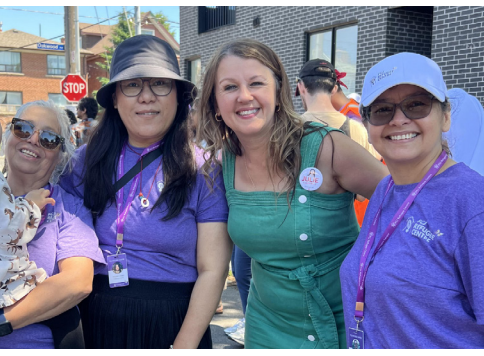
Great Times at the Annual FCT Street Party!