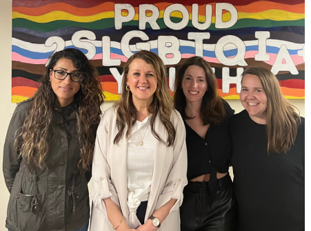
Chuvalo Neighbourhood Centre