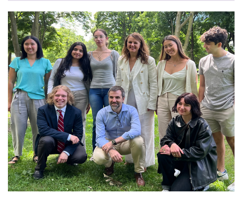
At Dufferin Grove Park with Environment Minister Steven Guilbeault and Davenport Youth Council

To date, these measures have reduced auto theft by 17%.