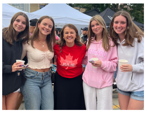
So Much Fun at Do West Fest!