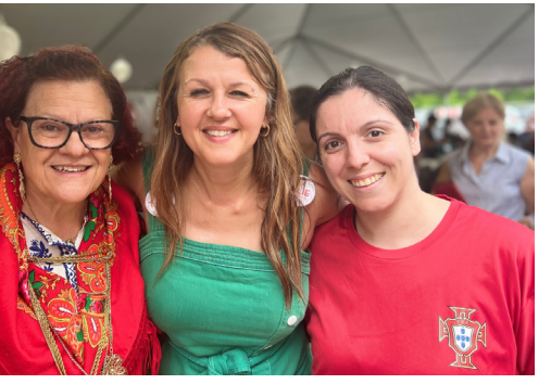
Celebrating Arsenal Do Minho's Festa de São João!