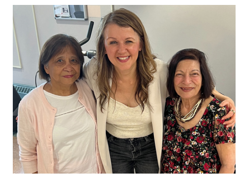
Every Day is Mother's Day: LA Centre