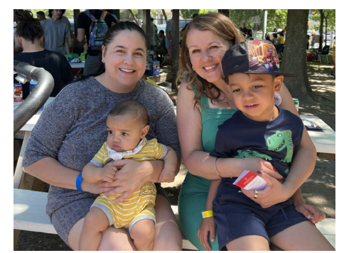
Summer Fun Fair at F.H. Miller