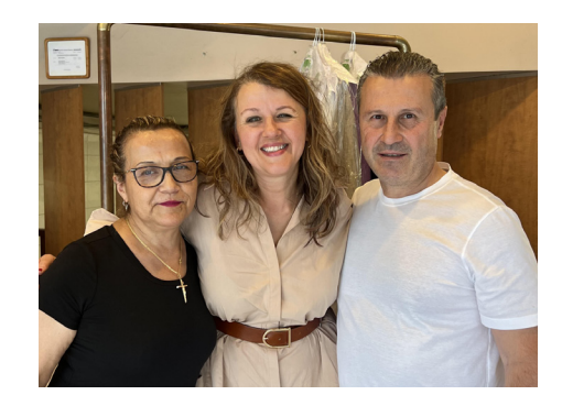
Thanking local business owner Certified Dry Cleaners on St. Clair West