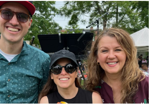
Great Food and Music at Carleton Village Fun Fair!