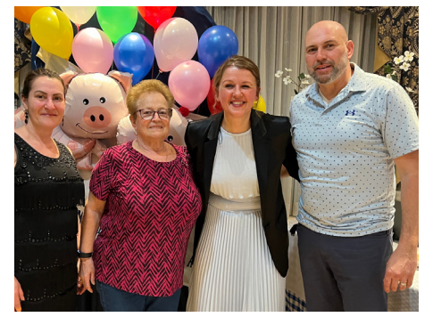
Clube Asas Do Atlântico Traditional Dinner at Casa dos Acores!