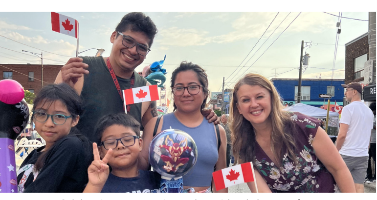
Feliz Dia de Portugal em Davenport!