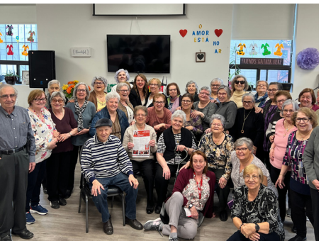
Lots of Smiles talking about the Canada Dental Plan at Abrigo Centre