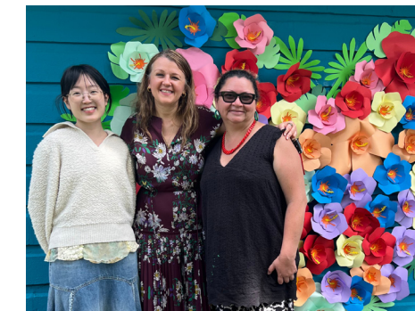
Enjoying MUSE Arts Creative Lab at Earlscourt Park